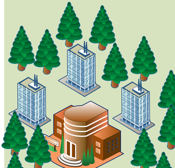
Math, Science, & Technology Center (MSTC)

Employer Corporate Partners Shared Office Space/Hub Zone: Fiscal Sponsor Awardee, Start-Up Tax Exempts Job Hunter-Employer Networking Zone