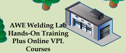
AWE Welding Lab Hands-On Training Plus Online VPL Courses

AWE is the Foundations Auto-Mechanics, Welding & Mechanical Engineering Training Program, Housed in 2 Labs