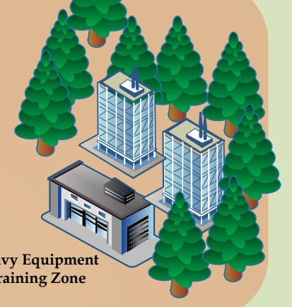
Heavy Equipment Training Zone