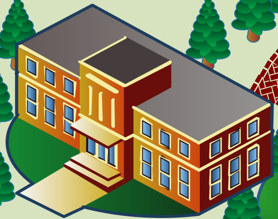
TLLF Main Headquarters Training Rental Space & Resource Center

Employer Corporate Partners Shared Office Space/Hub Zone: Fiscal Sponsor Awardee, Start-Up Tax Exempts Job Hunter-Employer Networking Zone